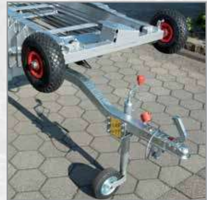
Drawbar with ball coupling permanently on the rails