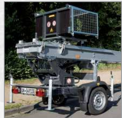
Compact chassis with integrated illumination