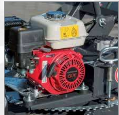
Drive via 230 volt electric engine or Honda petrol engine