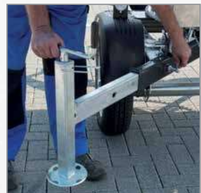
Extendable crank supports